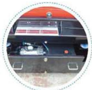
Slide-out Engine Tray