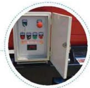
Electric Control Box