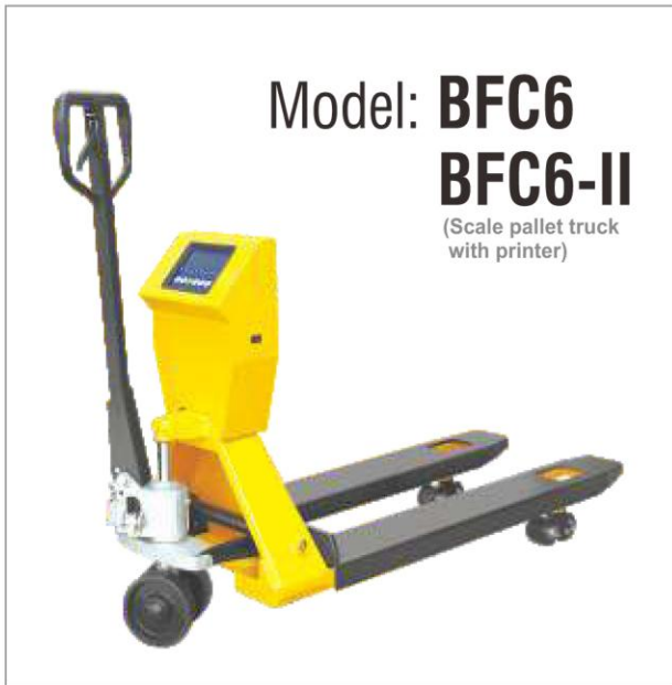
Model: BFC6 BFC6-II (Scale pallet truck with printer)