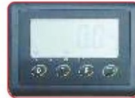
Model: BFC6-7 BFC6-8 (Scale pallet truck with printer)